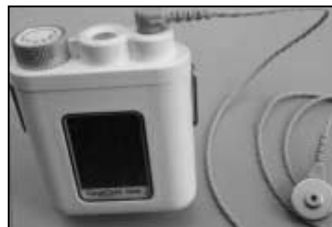
ComCare Solar Powered Hearing Aid

And speaking of communication... let us hear from you! Our mail & email addresses are located on the front page of this newsletter, as is our phone number. Tell us where and when you are going on short-term trips and we will pray for you! It is helpful to receive feedback from those of you who have fit the CCI aid – any problems, disappointments, joys, etc. This input helps us all as we take solar powered aids to unreached people!